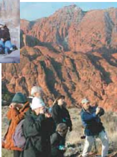
Interactive community events.