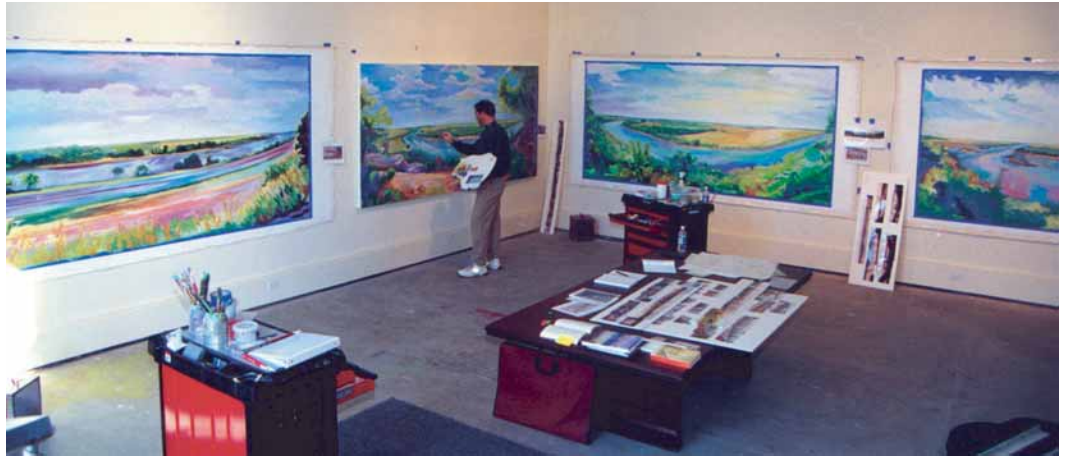
Comemorative paintings in studio. Will be available in print editions.